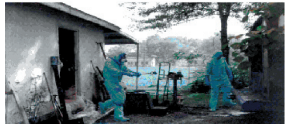
An Emergency Response Team Recovers a Damaged Americium Neutron Source in Texas

GTCC sealed sources consist mainly of americium neutron sources, other americium-241 sources, plutonium-238 heat sources, plutonium-239 neutron sources, and large strontium-90 sources. Large cesium-137 sources also typically exceed the U.S. regulatory criteria for shallow low-level radioactive waste (LLW) disposal, but are largely recycled and remanufactured into new sources.