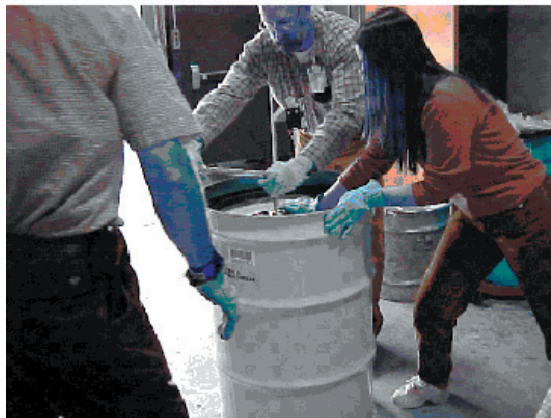
Packaged Sealed Sources Are Prepared for Shipping to LANL

No established disposition path exists for most GTCC sealed sources. The only suitable disposal site is the Waste Isolation Pilot Project (WIPP), a geological repository mined in bedded salt formations in southeastern New Mexico. It is restricted to transuranic waste generated from the nuclear defense program. A large share of waste from the OSR Project will be generated by the commercial and academic sector. These waste streams cannot be disposed of with Federal Government waste at WIPP.