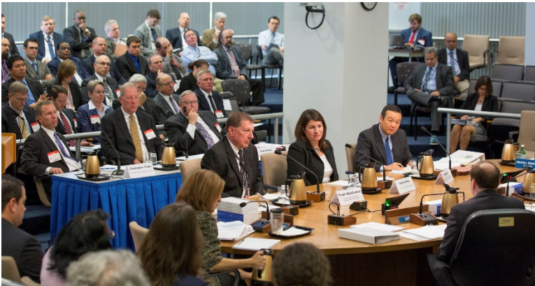
Mandatory hearing conducted by the Commission

The NRC documents its findings on site safety characteristics and emergency planning in a Safety Evaluation Report and on environmental protection issues in Draft and Final Environmental Impact Statements.